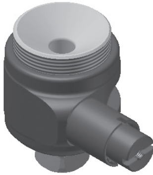
140100 External Clutch Lock Kit